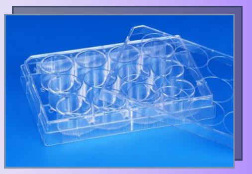
Tissue Culture Plate (6, 12, 24, 96 wells)