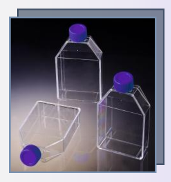
Tissue Culture Flask